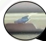
PREVIOUS KEEPER WEAR & TEAR